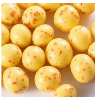
Coated chocolate beans